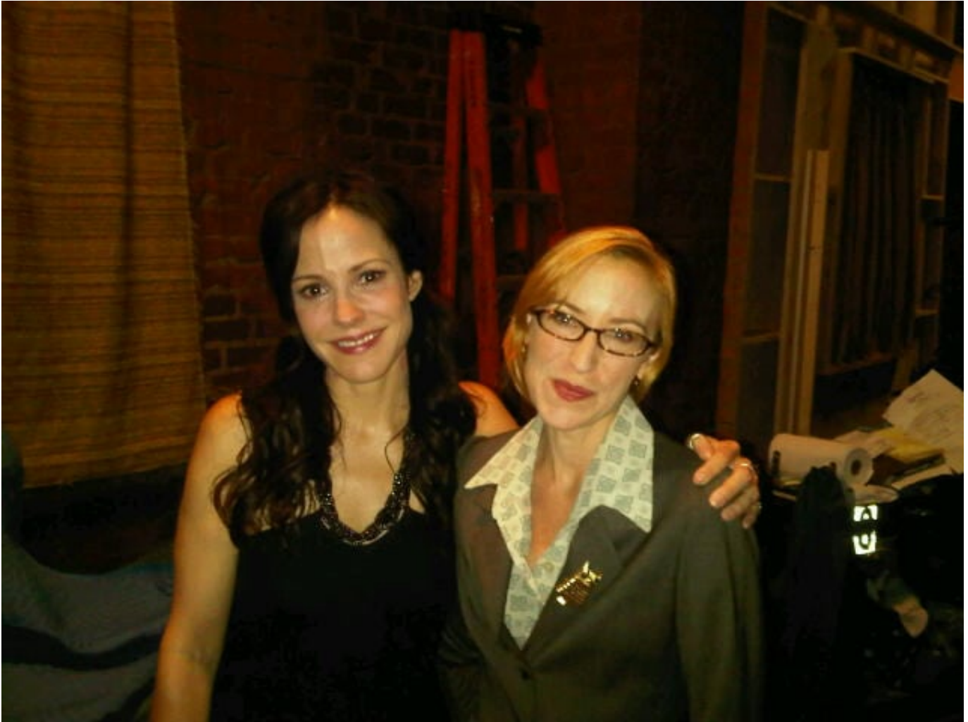
With Mary Louise Parker on the set of Weeds.

On the acting side, do you like movies or television shows better?